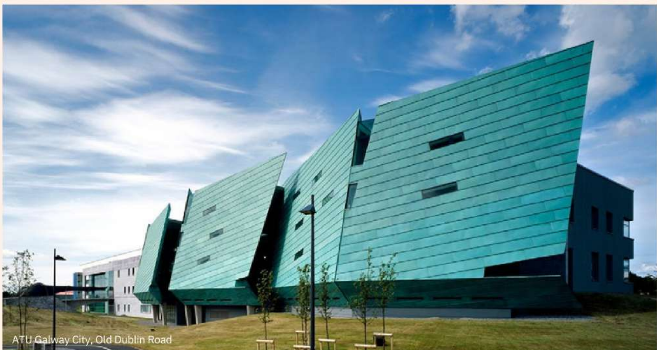
ATU Galway City, Old Dublin Road