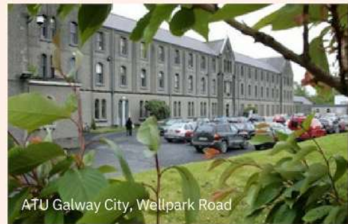
ATU Galway City, Wellpark Road