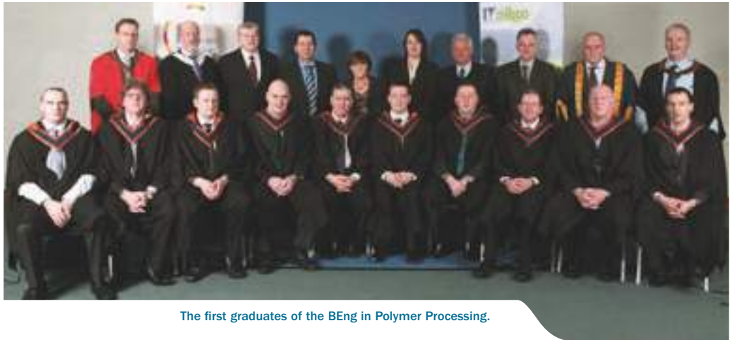
The first graduates of the BEng in Polymer Processing.

The first graduates of a unique BEng in Polymer Processing delivered jointly by IT Sligo and Athlone Institute of Technology were conferred. The online course was designed in 2009 in collaboration with First Polymer Training Skillnet to address what was a growing shortage of skills in the polymer (plastics) area.