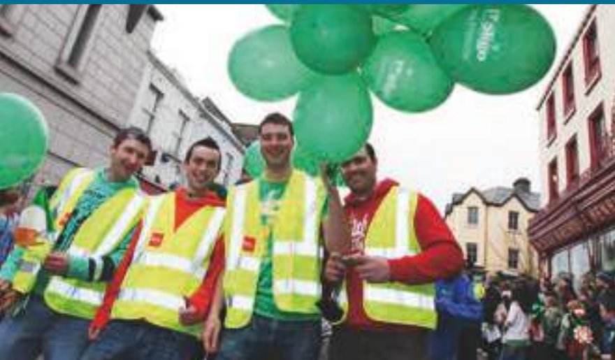
Students participating in the St Patrick's Day Parade.

St Patrick's Day Parade in Sligo Town and were rewarded with the Adjudicator Award for their efforts.