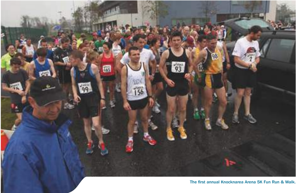
The first annual Knocknarea Arena 5K Fun Run & Walk.